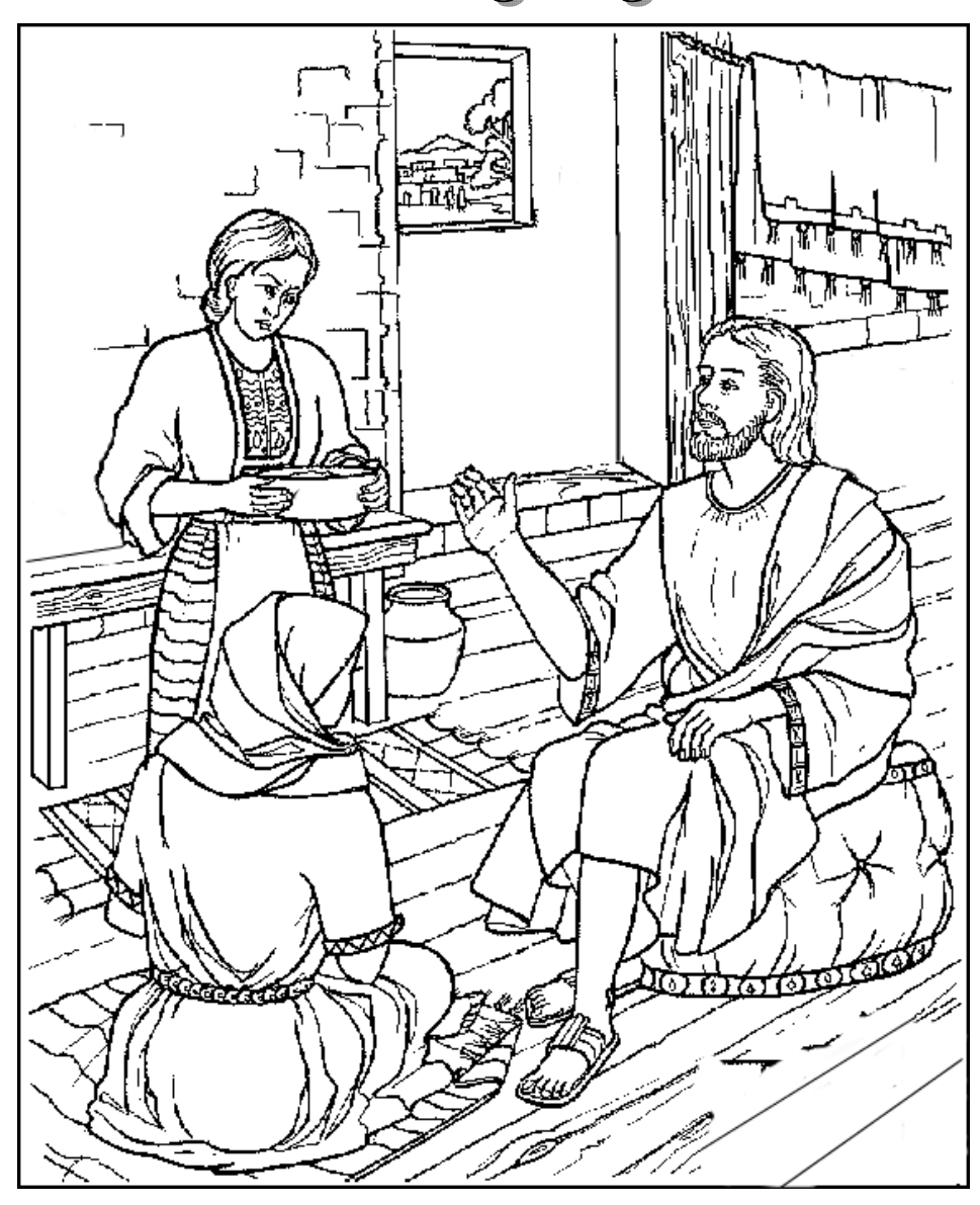
Jesus visits in the home of Mary and Martha. Luke 10:38:42